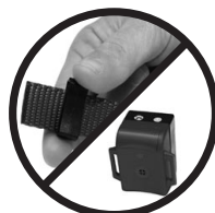
figure 3 a/b

Remove the keeper from the strap. (figure 3a) Orient the device so that the fill port and spray valve are facing up and the battery compartment is facing you. (figure 3b)